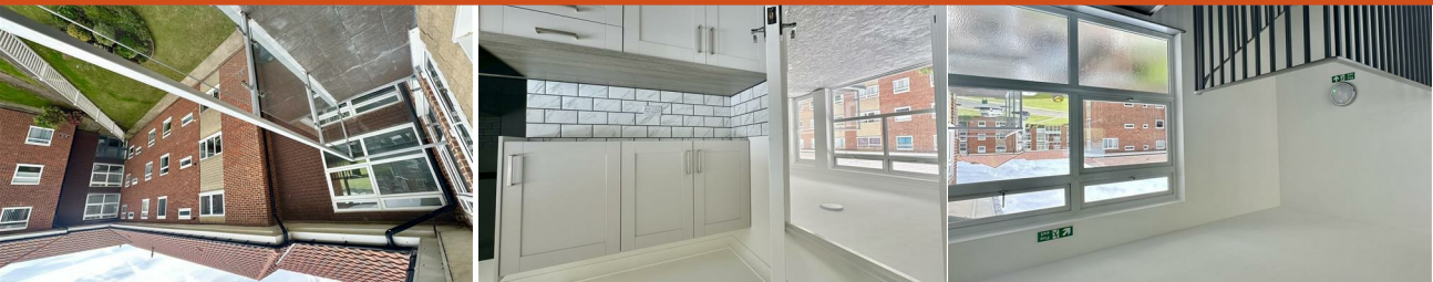
SECOND FLOOR 1040 sq. ft. (96.6 sq.m.) approx.

Merton court 25 Sutton Place, Bexhill-On-Sea, TN40 1PD